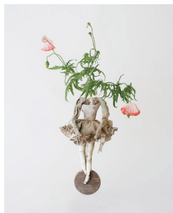
8 Atsunobu Katagiri Sacrifice , 2013