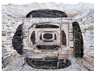
11 Marjan Teeuwen Destroyed House Krasnoyarsk 1 , 2010