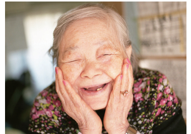
4 Atsushi Fukushima © Atsushi Fukushima