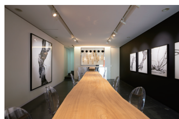
13 Ruinart Exhibition (Reference Image) Vik Muniz × Ruinart "Shared Roots" installation view Venue: ASPHODEL, 2019

*All the information (program, sponsors, venues...) announced for KYOTOGRAPHIE 2020 are confirmed up to December 4th, 2019.