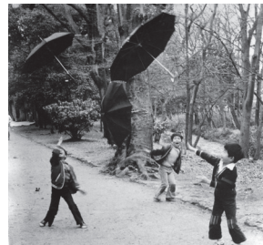
7 Kai Fusayoshi Throwing umbrellas , 1978 © Kai Fusayoshi