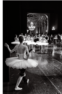
3 Pierre-Elie de Pibrac