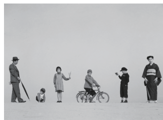
12 Shoji Ueda Dad, Mom and their children , 1949