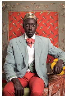
1 Omar Victor Diop