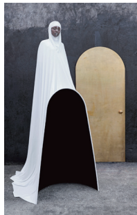
5 Maimouna Guerresi The Golden Door , 2011 © Maimouna Guerresi, Courtesy Mariane Ibrahim Gallery