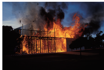
6 Alfredo Jaar The Skoghall Kunsthall , 2000 Public intervention, Skoghall Courtesy the artist, New York